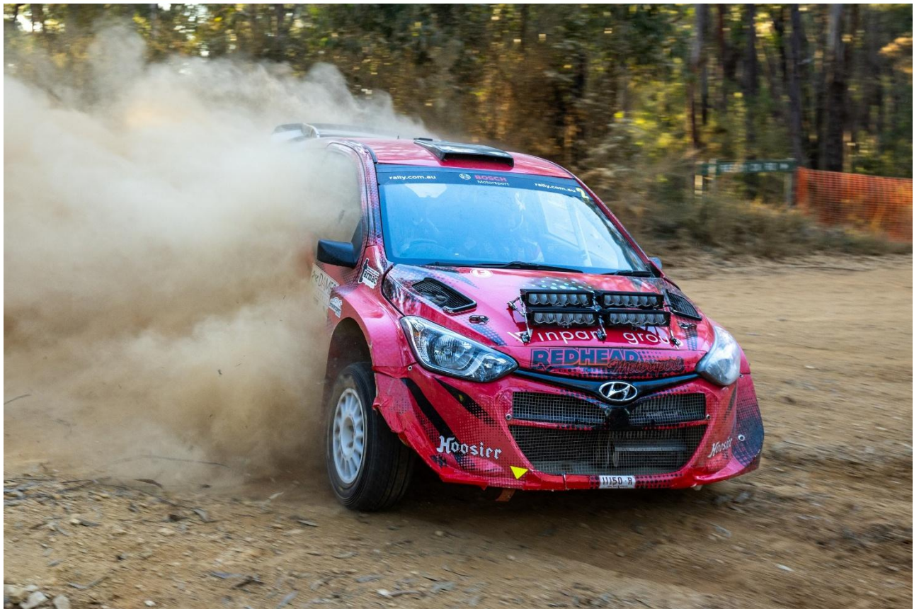
Josh Redhead and Ray Winwood-Smith – Winners of the 2024 DAMESA Industries Stages Rally.