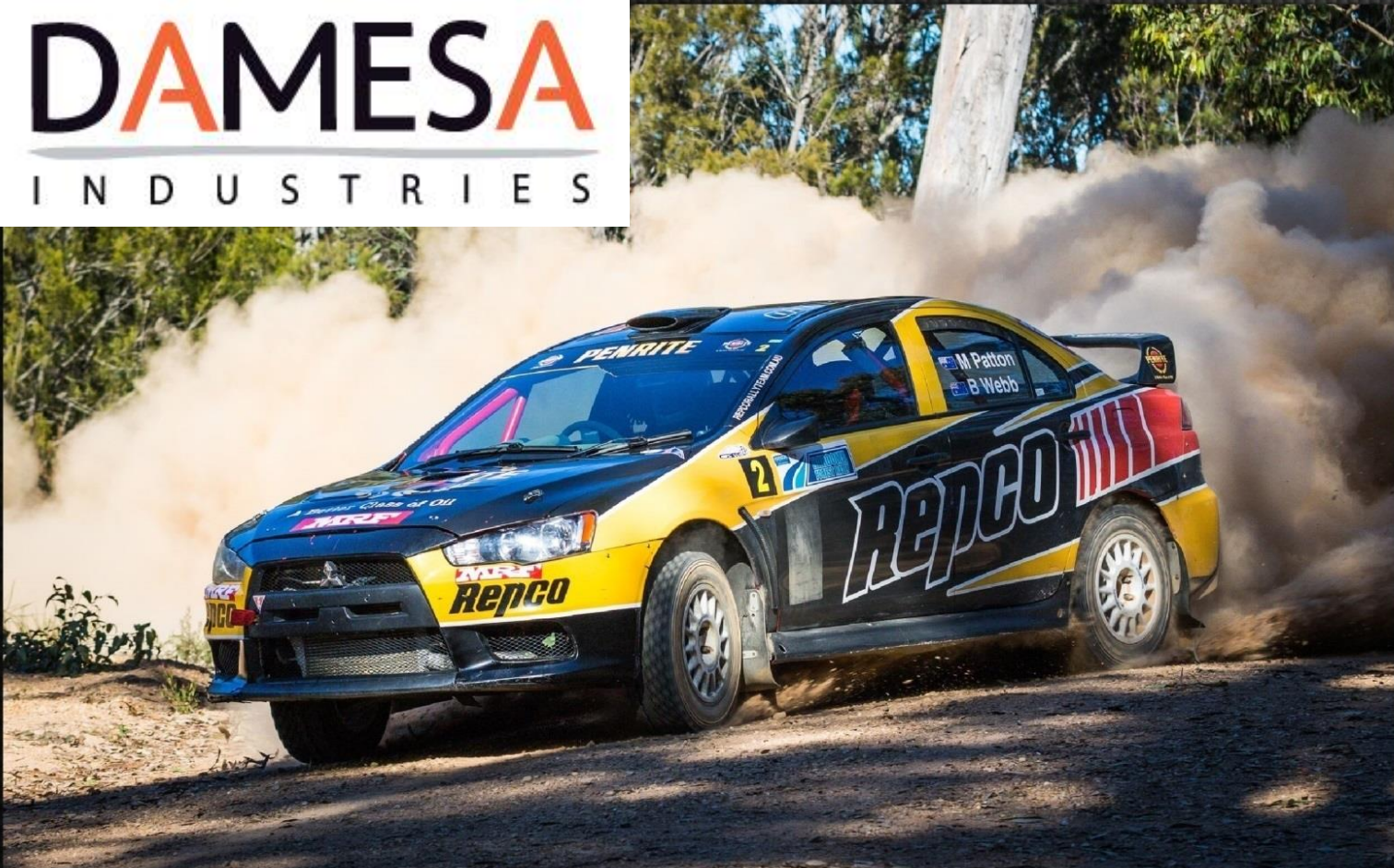
2018 Narooma Forest Rally Winners - Mick Patton and Bernie Webb